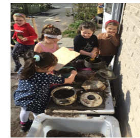
The Hedgehogs having fun in the sun